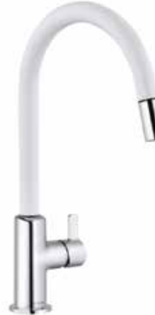
KLUDI BINGO STAR XS Pull Out White/Chrome H 1 395 H 2 220 A 210 Ø 38 DN Rating - 15 Min Pressure 2.0 Bar