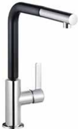
KLUDI L-INE S Pull Out Chrome/Matt Black H 1 295 H 2 265 A 220 Ø 38 DN Rating - 15 Min Pressure 2.0 Bar