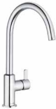
KLUDI BINGO STAR XS Swivel Chrome H 1 340 H 2 230 A 200 Ø 36 DN Rating - 15 Min Pressure 1.0 Bar