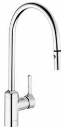
KLUDI BINGO STAR Pull Out Chrome Hand Spray H 1 435 H 2 225 A 220 Ø 48 DN Rating - 15 Min Pressure 3.0 Bar