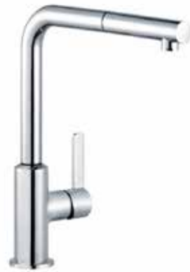
KLUDI L-INE S Pull Out Chrome H 1 295 H 2 265 A 220 Ø 38 DN Rating - 15 Min Pressure 2.0 Bar