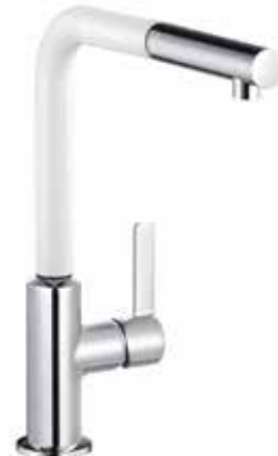
KLUDI L-INE S Pull Out Chrome/Matt White H 1 295 H 2 265 A 220 Ø 38 DN Rating - 15 Min Pressure 2.0 Bar