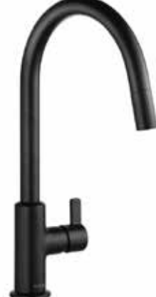
KLUDI BINGO STAR XS Pull Out Matt Black H 1 395 H 2 220 A 210 Ø 38 DN Rating - 15 Min Pressure 2.0 Bar