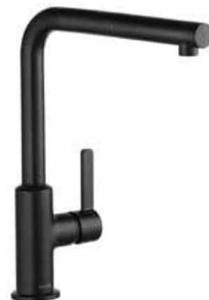
KLUDI L-INE S Pull Out Matt Black H 1 295 H 2 265 A 220 Ø 38 DN Rating - 15 Min Pressure 2.0 Bar