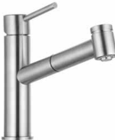
KLUDI Steel Solid Stainless Steel Pull Out Hand Spray H 1 200 H 2 125 A 215 Ø 44.5 DN Rating - 15 Min Pressure 3.0 Bar