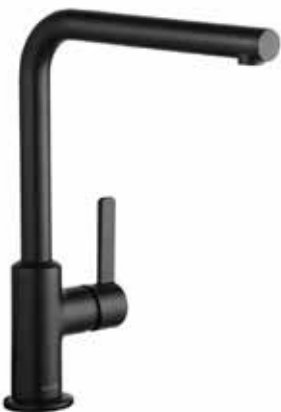
KLUDI L-INE S Swivel Matt Black H 1 285 H 2 260 A 210 Ø 36 DN Rating - 15 Min Pressure 1.0 Bar