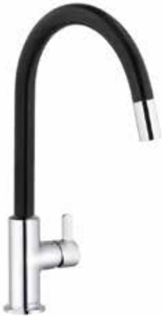
KLUDI BINGO STAR XS Pull Out Black/Chrome H 1 395 H 2 220 A 210 Ø 38 DN Rating - 15 Min Pressure 2.0 Bar