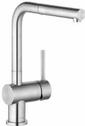
KLUDI L-Steel Pull Out Stainless Steel Brushed H 1 300 H 2 270 A 220 Ø 52 DN Rating - 15 Min Pressure 2.0 Bar