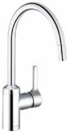
KLUDI BINGO STAR Pull Out Chrome H 1 370 H 2 220 A 215 Ø 48 DN Rating - 15 Min Pressure 2.0 Bar