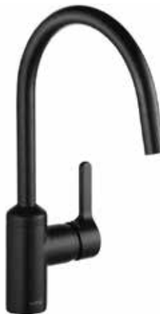
KLUDI BINGO STAR Pull Out Matt Black H 1 370 H 2 220 A 215 Ø 48 DN Rating - 15 Min Pressure 2.0 Bar