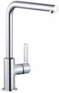
KLUDI L-INE S Swivel Chrome H 1 285 H 2 260 A 210 Ø 36 DN Rating - 15 Min Pressure 1.0 Bar