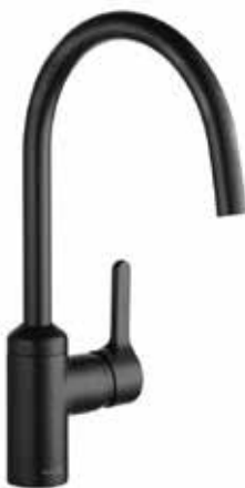
KLUDI BINGO STAR Swivel Matt Black H 1 375 H 2 230 A 215 Ø 48 DN Rating - 15 Min Pressure 1.0 Bar