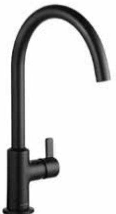
KLUDI BINGO STAR XS Swivel Matt Black H 1 340 H 2 230 A 200 Ø 36 DN Rating - 15 Min Pressure 1.0 Bar