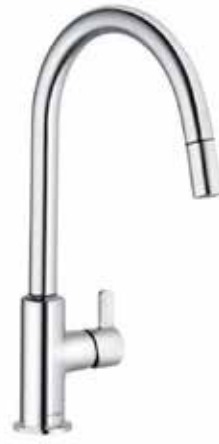
KLUDI BINGO STAR XS Pull Out Chrome H 1 395 H 2 220 A 210 Ø 38 DN Rating - 15 Min Pressure 2.0 Bar