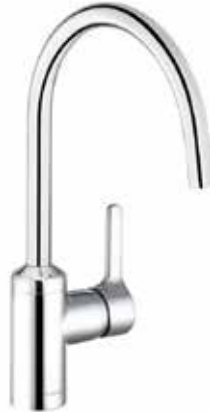
KLUDI BINGO STAR Swivel Stainless Steel Look H 1 375 H 2 230 A 215 Ø 48 DN Rating - 15 Min Pressure 1.0 Bar