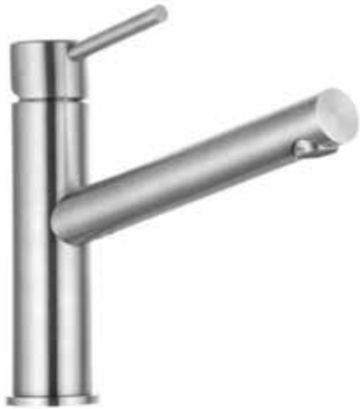
KLUDI Steel Solid Stainless Steel Swivel H 1 200 H 2 135 A 210 Ø 44.5 DN Rating - 15 Min Pressure 1.0 Bar